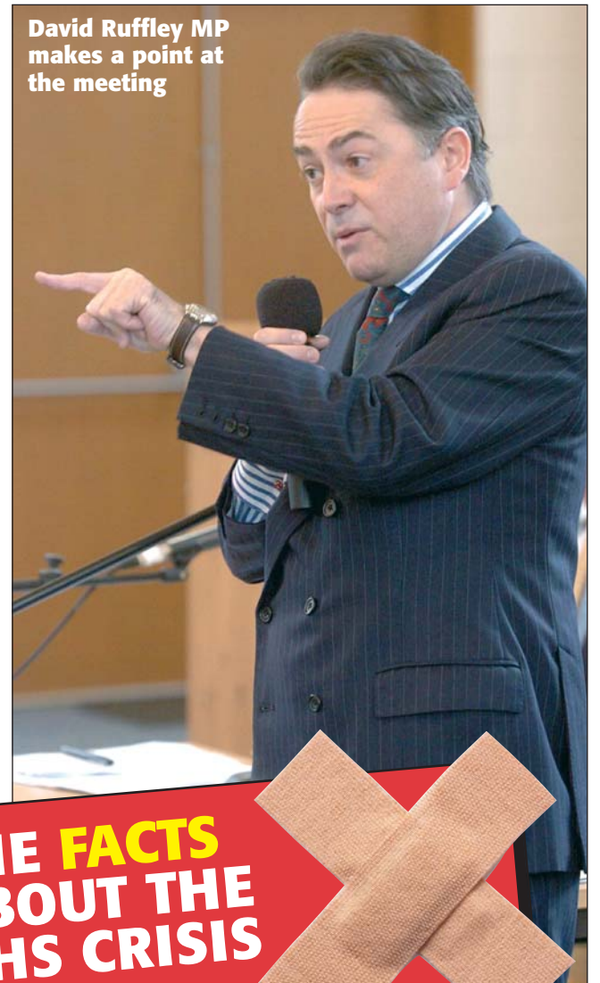
David Ruffley MP makes a point at the meeting

"I will continue to fight for a better deal for Suffolk health care."